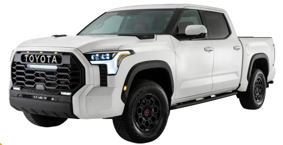
2022 Toyota Tundra

Ultramid and Elastocoat are registered trademarks of BASF SE Continuous Composite Systems (CCS) is a trademark of L&L Products Tundra is a trademark of Toyota